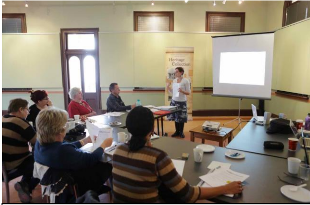
Workshop in Mackay Old Town Hall